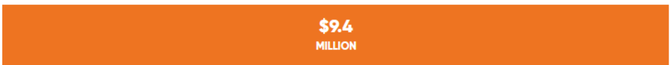
Equity and Risk Capital Investments